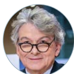
Thierry Breton Commissioner, Internal Market, European Commission

Key Speakers from the previous edition of European Space Forum Conference